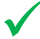
Roof with no missing or mismatched shingles